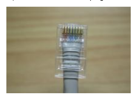
9) Patch cord assembly is finished.