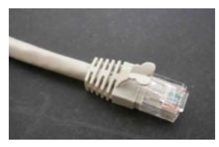
10) Finish modling and make sure your cable has a professional appearance.