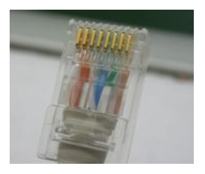
7) Put the cable into the plug.