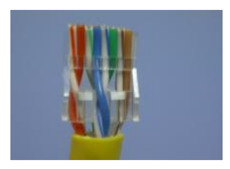
6) Cut the 8 wires outside the insert.