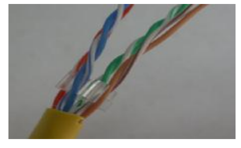
4) Put the 8 wires into crossing insert down according to 568B wiring.