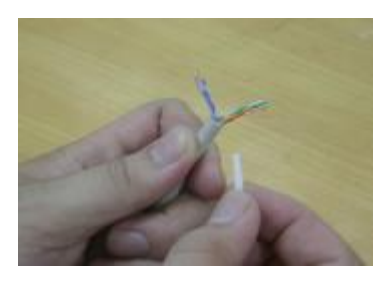
3) Cut the crossing layer of 8 wires